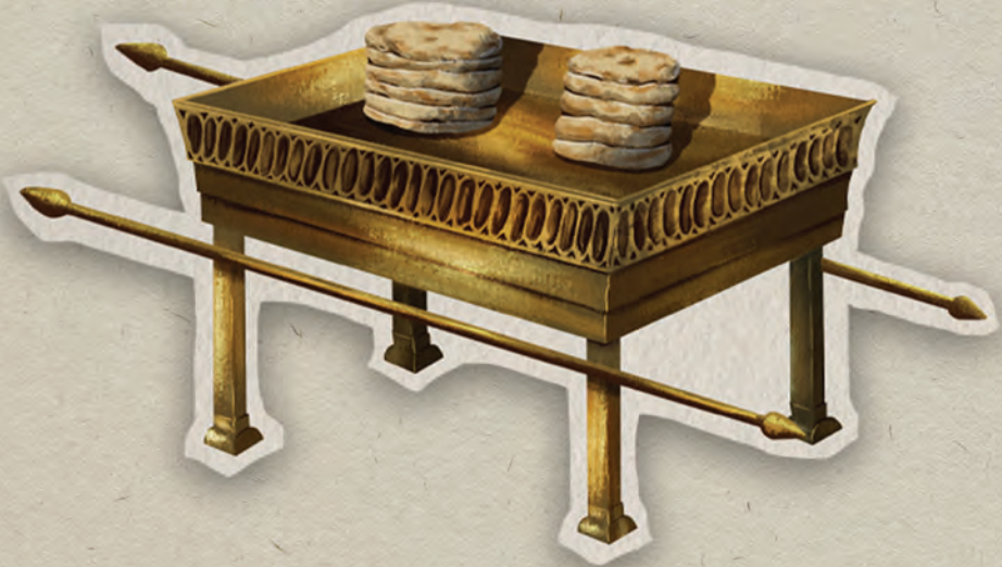
Table of Showbread

The Showbread is the symbol of the Word of God.